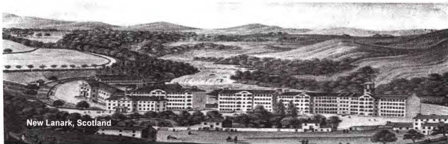
New Lanark, Scotland

The first cooperative village store was established in 1813 at the cotton mills of New Lanark, Scotland by Owen which sold goods of higher quality but with lower price compared to existing stores in the area.