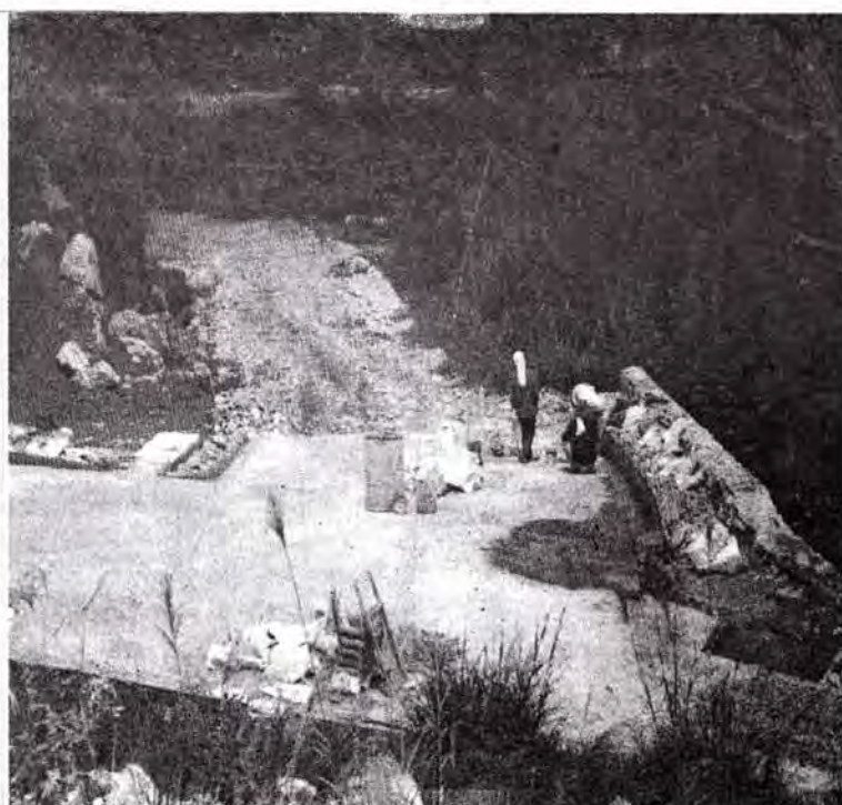
Workers in the middle of constructing the main entrance of the subdivision where the main gate will be erected.