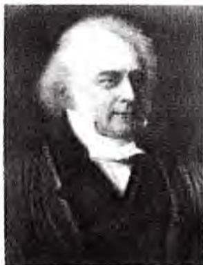
Robert Owen (1771-1858)