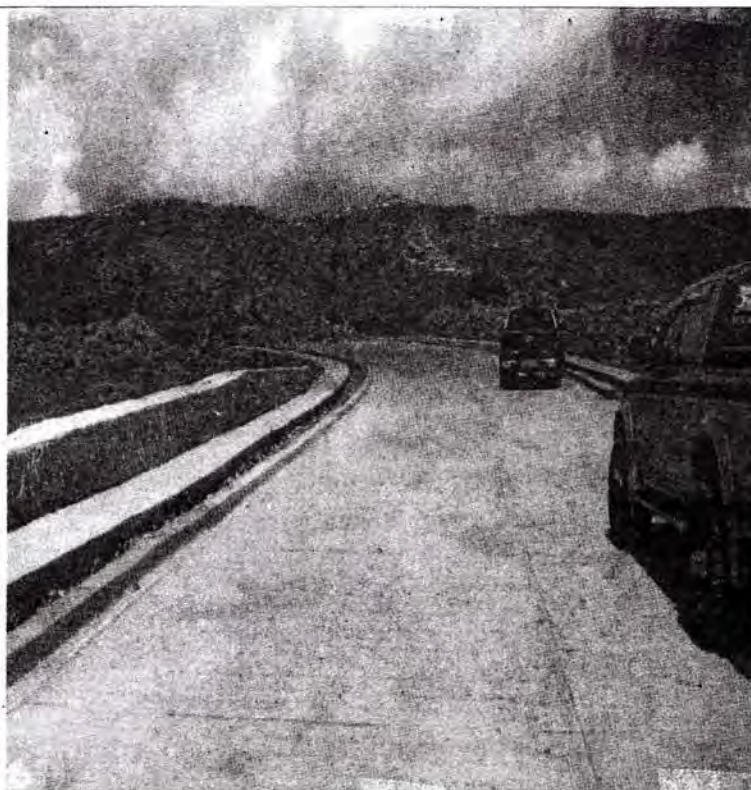
The main road as viewed from the entrance of the subdivision.