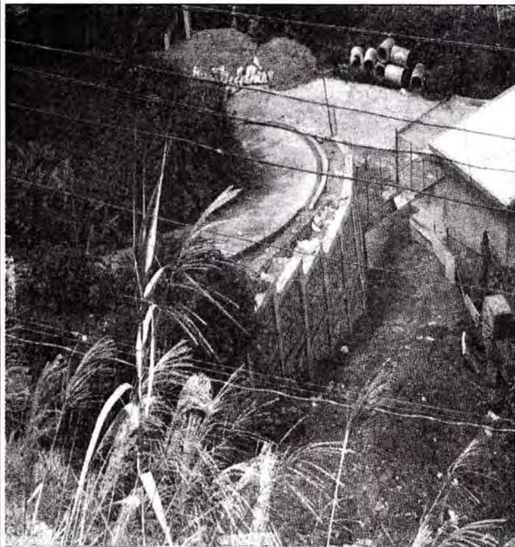
Block 2 Alley undergoing excavation and rip-rapping.