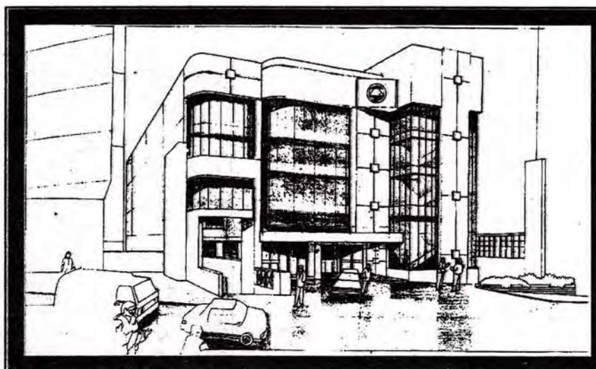
The perspective view of the new BBCCC building which is currently constructed at the site of the old BBCCC offices located at Assumption Road, Baguio City.

The cost of the building is formidable but the Board is considering, if at all possible, internal fund sourcing. Thus there was the launching of the Building Investment Scheme at the close of the morning. The pledging session netted an initial amount of some two hundred thousand pesos.