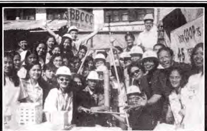
BBCCC Members, Staff and Officers posing together in the cornerstone laying.