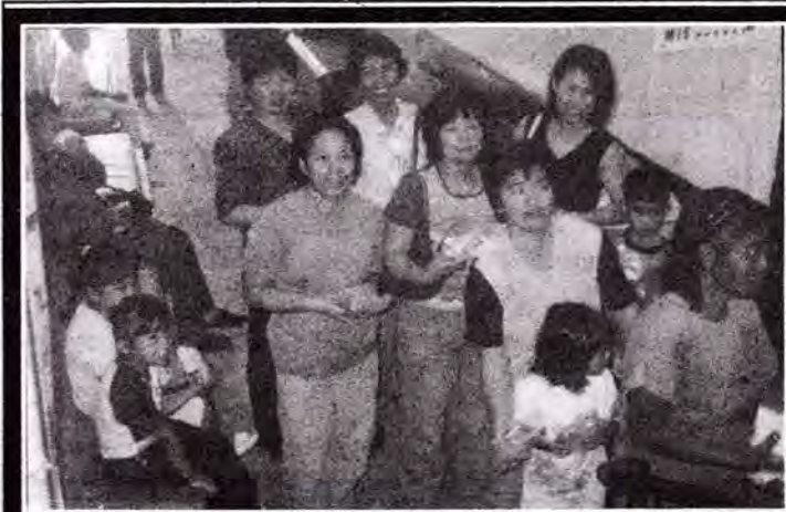
Members with their sandwich as merienda during the BBCCC's 45th Year anniversary