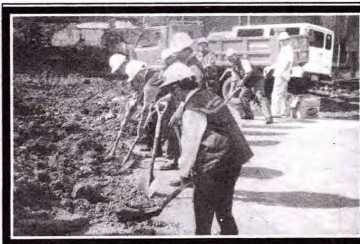
"The shoveling" during the Ground-breaking ceremony of the new BBCCC building held last October 11, 2003