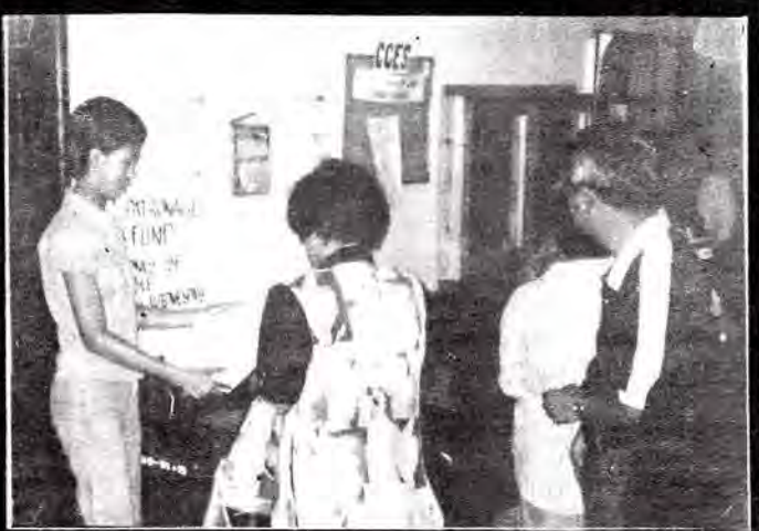
One of the thousands of Coop members receiving her yearly dividend