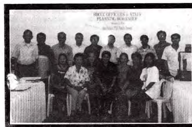
... You are in Good Hands!!! BBCCC officers and staff dept heads who participated in this year's strategic planning