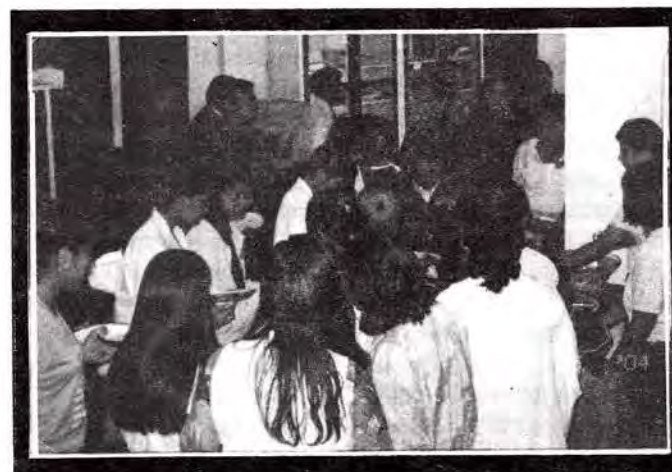
Wanna be ka ba o wanna be iba? — Some officers and the BBCCC scholars during the latter's recognition of graduates