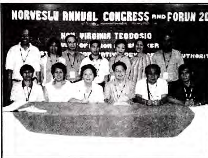
The BBCCC participants to the NORWESLU Annual Congress and Forum 2004 held last June 4-6, 2004 at Pagdaraoan, San Fernando City, La Union.

Incidentally, Module V – ASSET LIABILITY MANAGEMENT, AND BOARD DEVELOPMENT AND PERFORMANCE EVALUATION – is scheduled to be conducted in the Bicol Region on August 27-29, 2004.