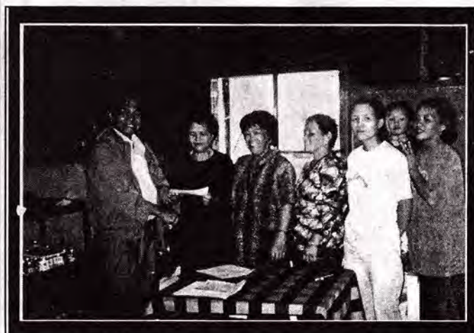
O bakit nakangiti kayo, di ba namatayan kayo? Dahil po sa biyayang ibinigay ng BBCCC na tulong sa pamamagitan ng Programang Death Aid Fund.