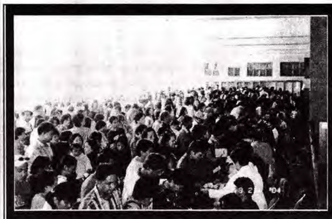
Ano bang meron at nagsisik-sikan kayo dyan, meron bang 'relief goods' galing sa ibang bansa? Sila po ang mga BBCCC members na dumalo sa nakalipas na Annual General Assembly.