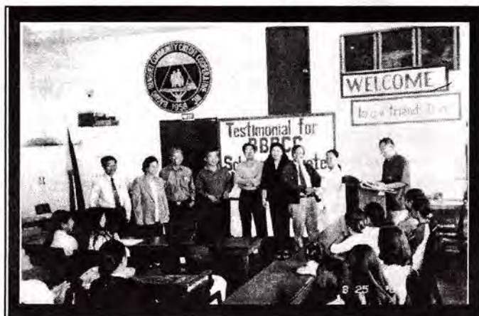
The young "once" and the young "ones". Ang mga haligi at pag-asa ng ating kooperatiba!