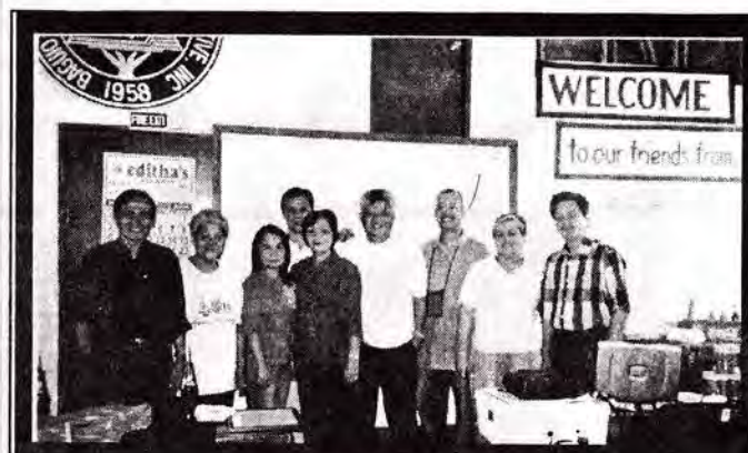
Ang ating BBCCC sinugod ng mga taga ibang kooperatiba. Bakit kaya?... ? ... ?