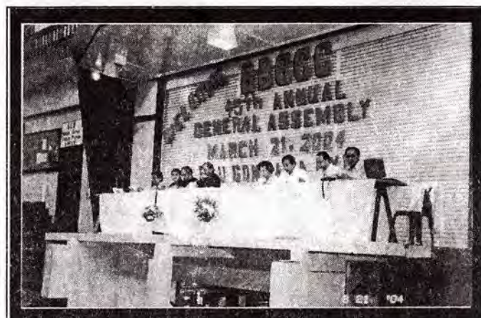
The Board of Directors and Officers giving their respective reports for the past fiscal year during the BBCCC 45th Annual General Assembly last March 21, 2004.