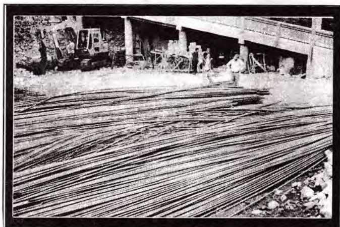
"Cge man ngarud kitaen tayo no sino kadakayo nga dua ti kaaduan ti mabunagna nga landok nga maipan ijay BBCCC."