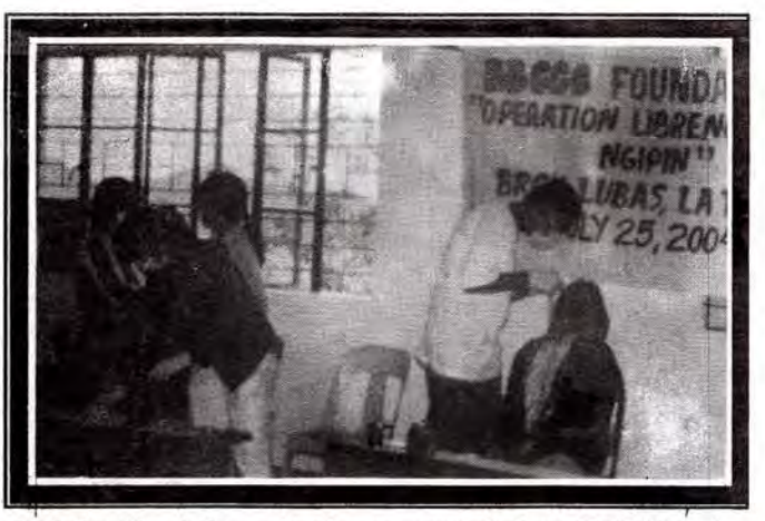
B?d cheetah...buka... where's my mountain dew drinks? Doc it seems that it's better to use a long nose plier to easily accomplish your job.