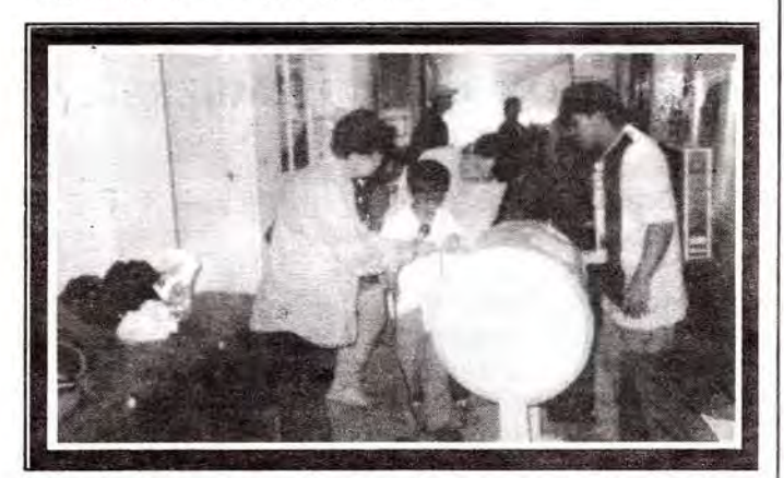
The winning number combination for our 8/9 coop draw is 2-2-2-22 (B-B-C-C-C). Congratulations to all the winners!