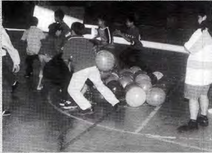
Mga bata takbo andyan na si "Meaning Go... .. at kunin ang mga gift ninyo"...