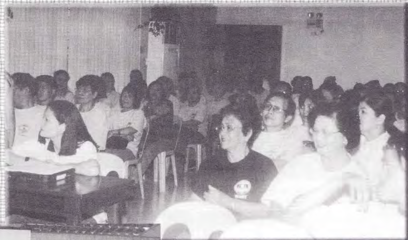
The BBCCC delegation attentively watches the Audio-Visual presentation prepared by the PPCC in their multi purpose function hall.