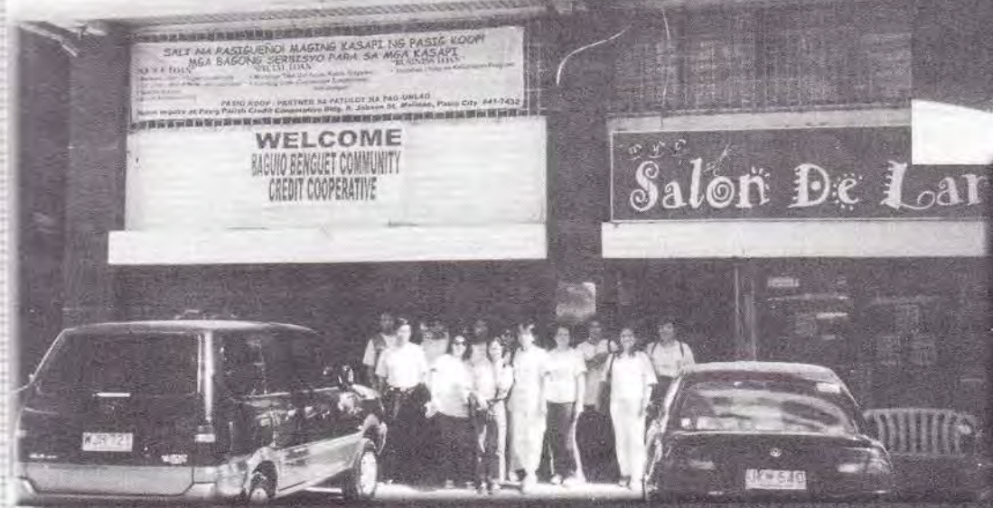
The BBCCC and PPCC officers pose as the BBCCC graciously accept the tokens given by the PPCC.