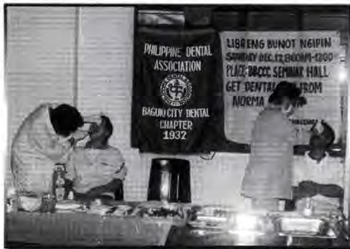
Two volunteer dentists doing tooth extraction during the BBCCC sponsored free dental examination and extraction held last December 12, 2004 at BBCCC Hall

The Operation Libreng Bunot Ngipin is a current project of the BBCCC Foundation, in line with its mission of reaching out to the marginalized members of the community and in keeping with the social responsibility of the BBCCC.