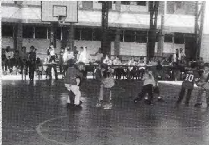
Did you know that our coop holds the record for having the most conjoined twins? Others are not even shown here... Here they are, the BBCCC balloon kids ... or do they want to become wrestling greats someday?