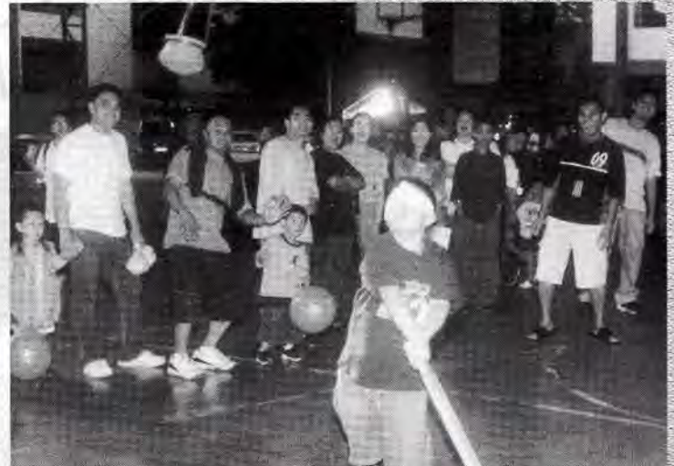
Believe it or not... Someday... BBCCC will produce the first player ever to play baseball with covered eyes... And he will be the greatest player of all time... worldwide ... More practice ...