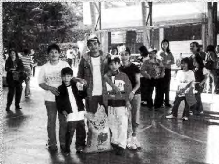
O ano inggit ba kayo sa bigas na napanalunan namin nung Family Day?... Attend kasi kayo pag may coop affairs... Maraming salamat BBCCC !