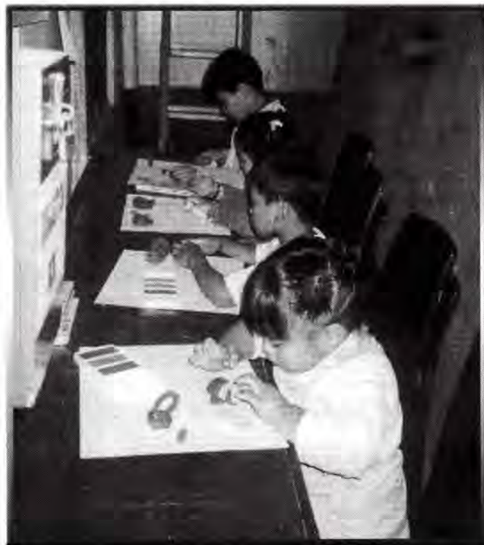
The cute participants concentrate on their clay-molding as they create their masterpieces! The four were able to finish after an hour of battling with the clay.

For those who missed the activity, we do hope that you can join us in our next Art Day!