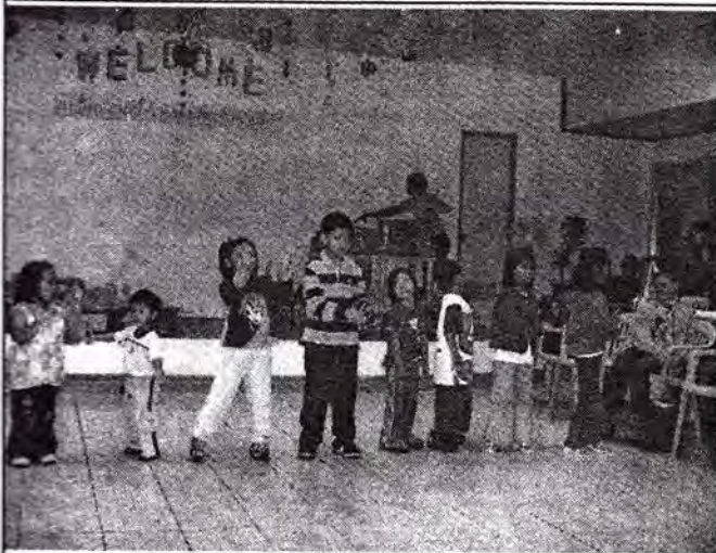
Young tykes perform the Pinoy Big Brother dance