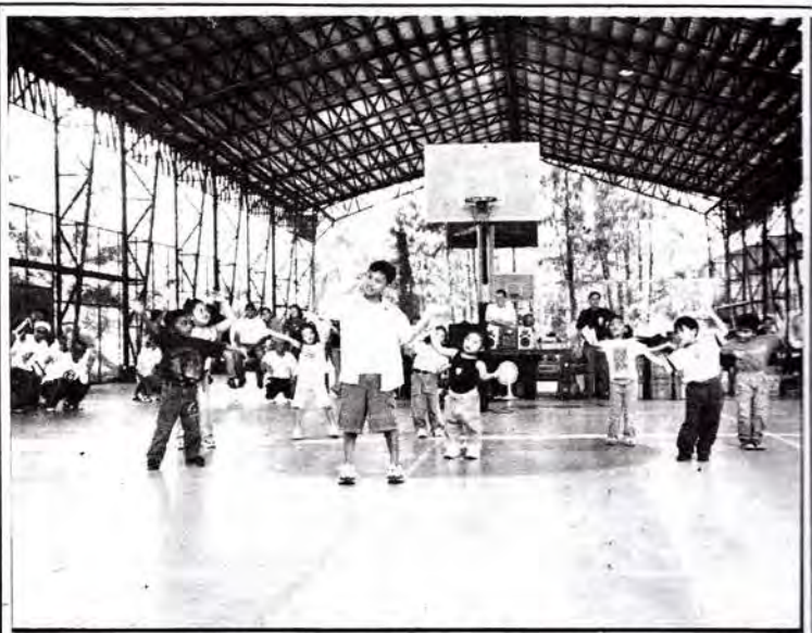
The BBCCC Foundation Preschool pupils following their dance leader during the BBCCC Family Day Celebration held last November 6, 2005 at SLU Covered court.