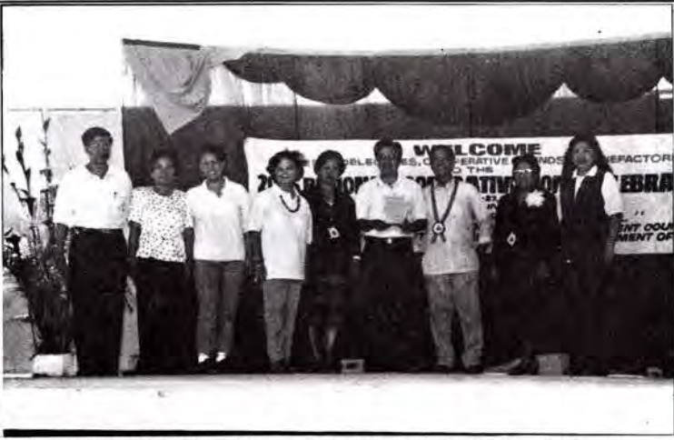
Some of the BBCCC delegates during the Reg'l Coop Month celebration held in Apayao on October 26-27, 2005