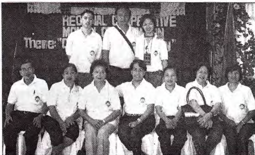
The BBCCC Officers, Staff and members pose for posterity after receiving the Most Outstanding Cooperative Award in the Region during the Regional Cooperative Month Celebration held in Dagupan, Tabuk, Kalinga on October 26-27, 2007.