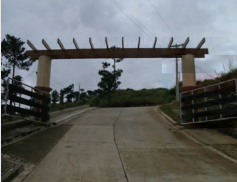
MAIN GATE OF THE SUBDIVISION