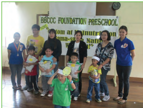
Nutrition Month Poster- Making Contest Winners