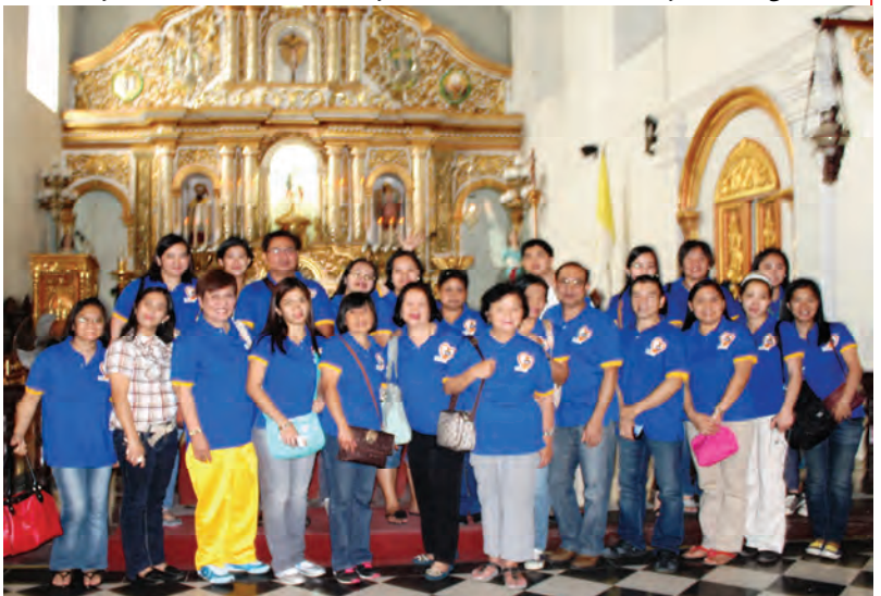
Barasoain Church Altar ...after a prayer visit.