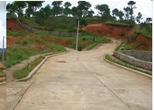
ROADS ARE FULLY CEMENTED

Re-organization of the BBCCC Home-owners Association will be on Dec. 21, 2013 (Sat) at 2P.M. to be held at BBCCC Hall Annex 2-A.