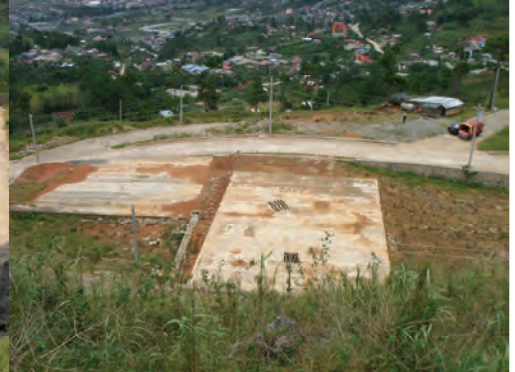
MAIN OPEN SPACE