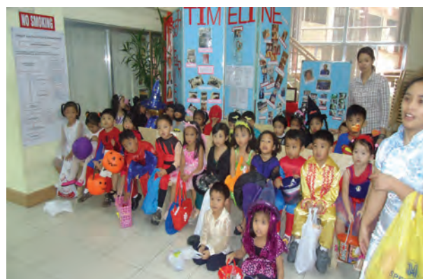
Pupils in their varied Halloween costumes

The Preschool, always in step with the thrusts of the Dep. Ed, had several meaningful activities in the past months.