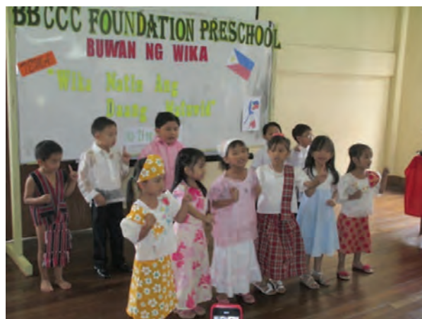
Linggo Ng Wika Dance Contest