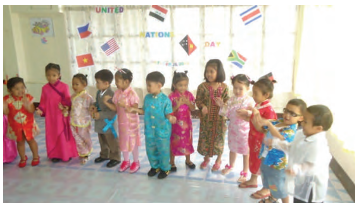
Pupils in their international costumes