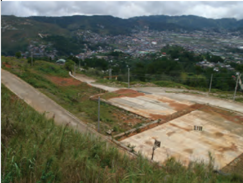
Open space overlooking La Trinidad, Benguet