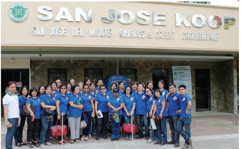
Façade of San Jose Coop ... after the inter-coop sharing.